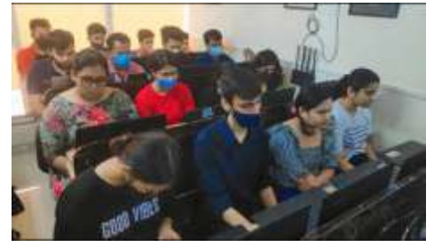
Real Classes Images